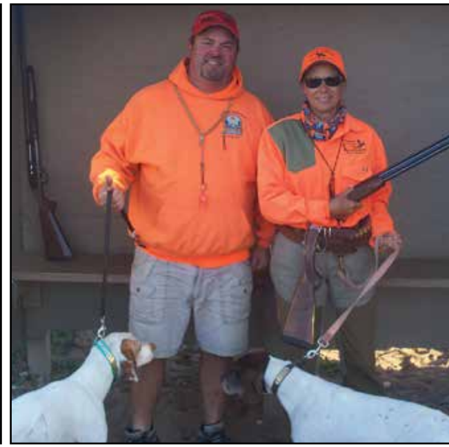
APRIL/MAY & JUNE/JULY 2020 | 46 | WWW.NSTRA.ORG