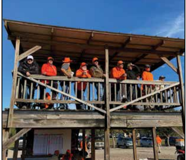
The Gallery in the final hours...