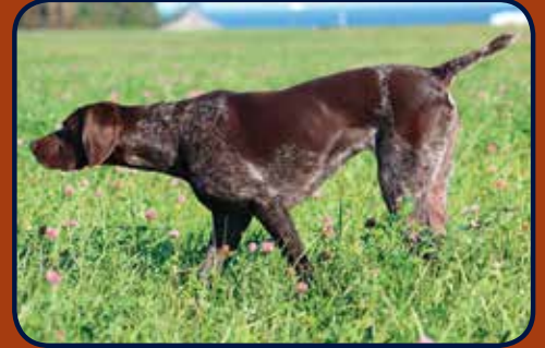
Central Cananda Region