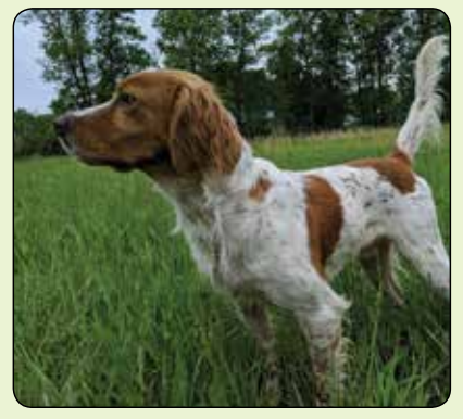
Ohio Region Champion Rudds Running Rusty