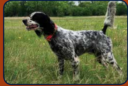
WHIZBANG BLACK PEARL OWNER CHAD MANTZ