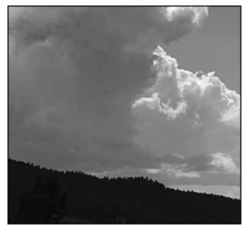
Pikes peak trial. Every day thunder heads would grow above the hills and usually give us a lightning show with rain and hail stopping the trial.