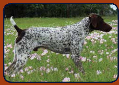
Gulf Coast Region