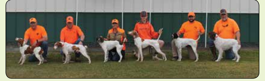
EC Regional Top 6 2019

Saturday, March 16th, we kicked off our Regional Elimination Round 1.