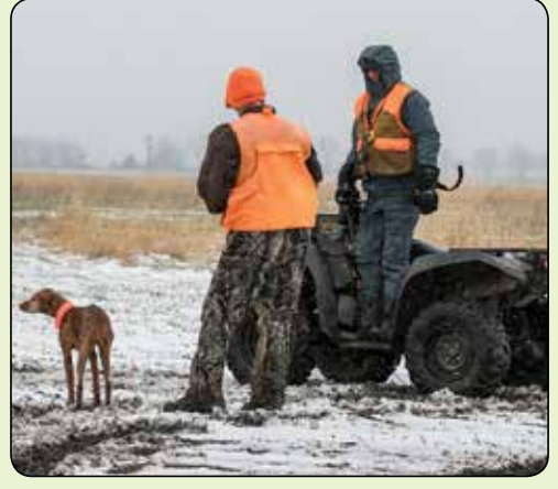
Talking with the Judge