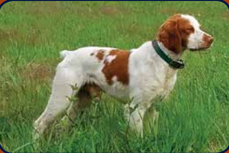
North West BLAZ Region