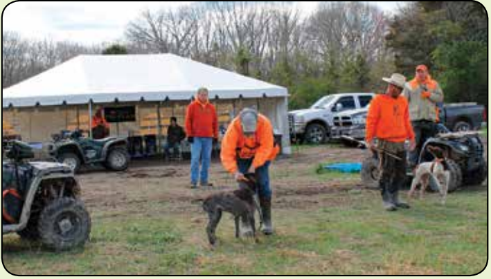
The Final Hour turns loose.