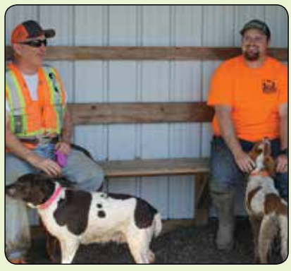
In the blind for the Final Hour