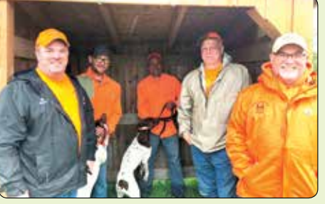
Final 6 In the Blind