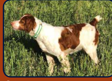
Northern 5C'S ELI'S TRIGGER FINGER Illinois Region