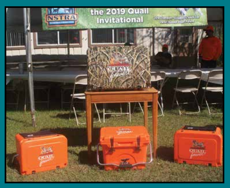
Quail Forever Coolers