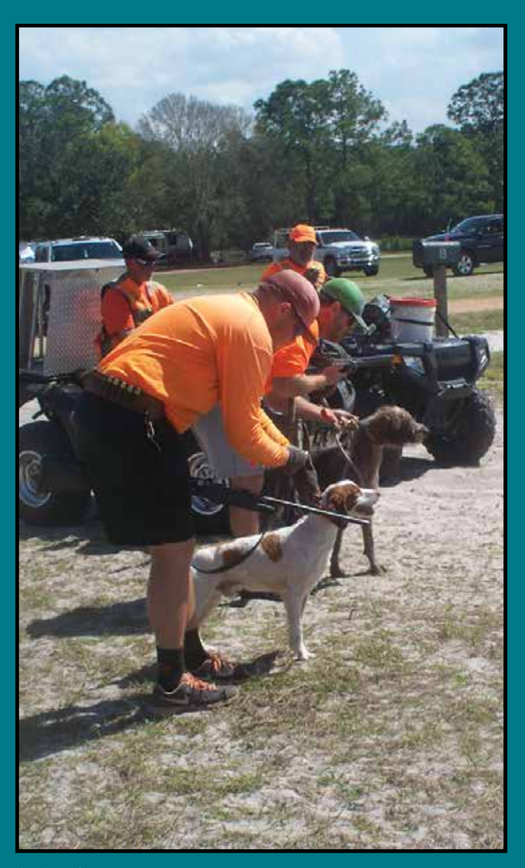
At the Line