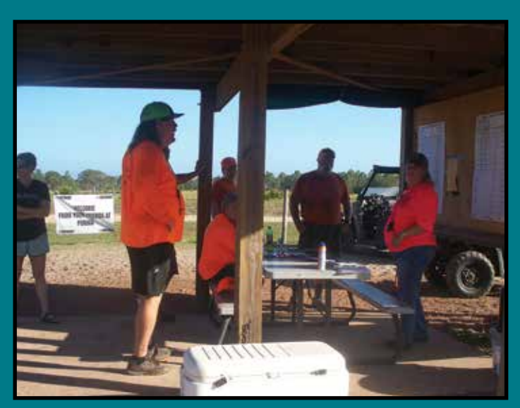
Checking the Scoreboards