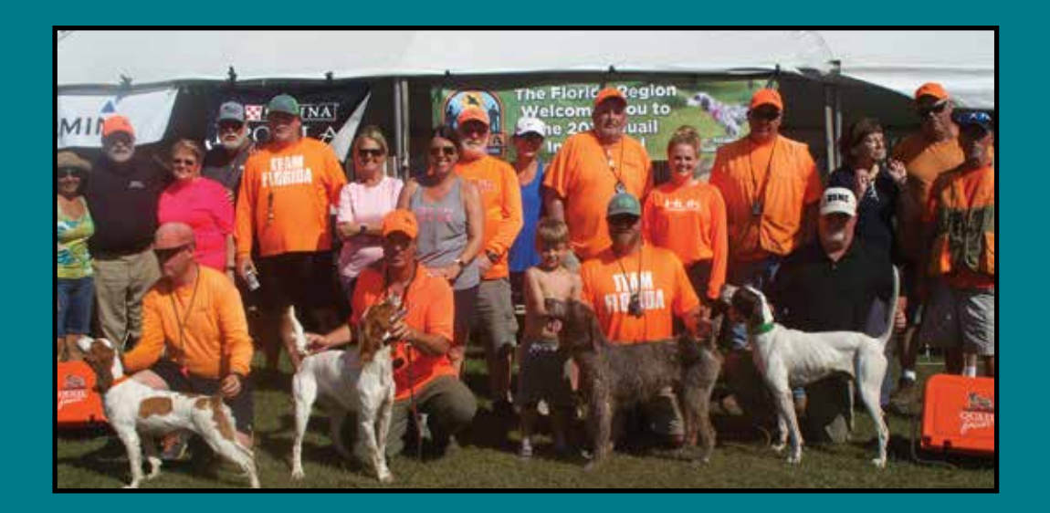
Top 4 with Gallery