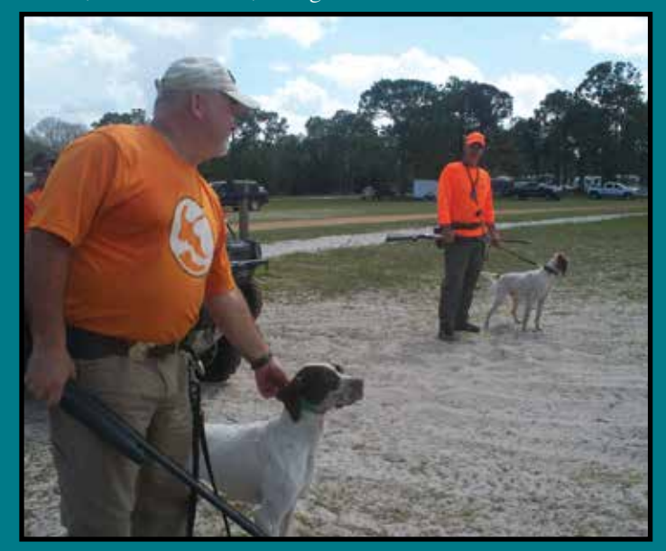
At the Line