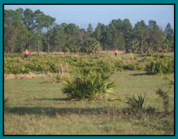
Trialing among the Palmettos