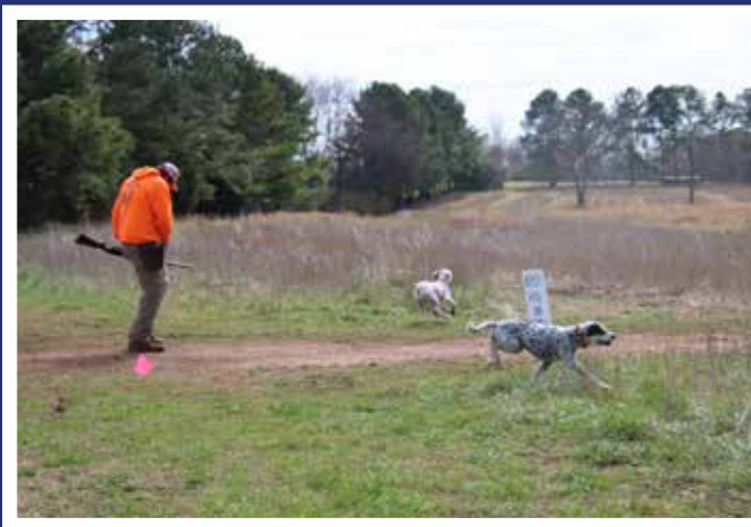
OK Jack, it's time to hunt