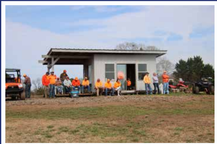
The Final 6 Spectators