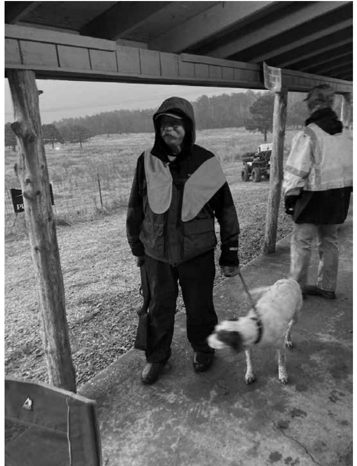
A bit of rain and cold!