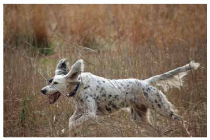
Ziva on the move