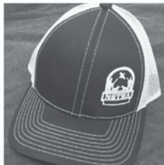
NSTRA LFP Hat blk/yellow $18.00