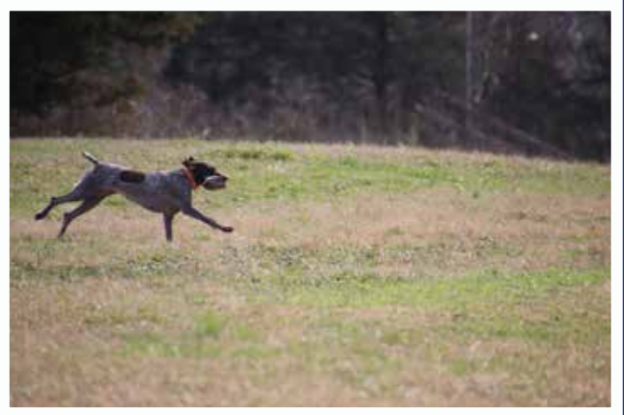
Gracie with a retrieve