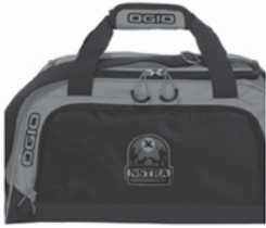
Breakaway Duffel $49.00