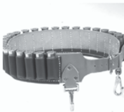
Leather Shell Belt $100.00