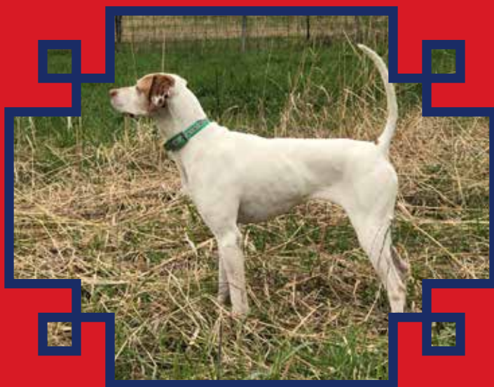
The 2nd runner-up Button's Up (Blazer) Owned and handled by Brian Boals (Kentucky region)