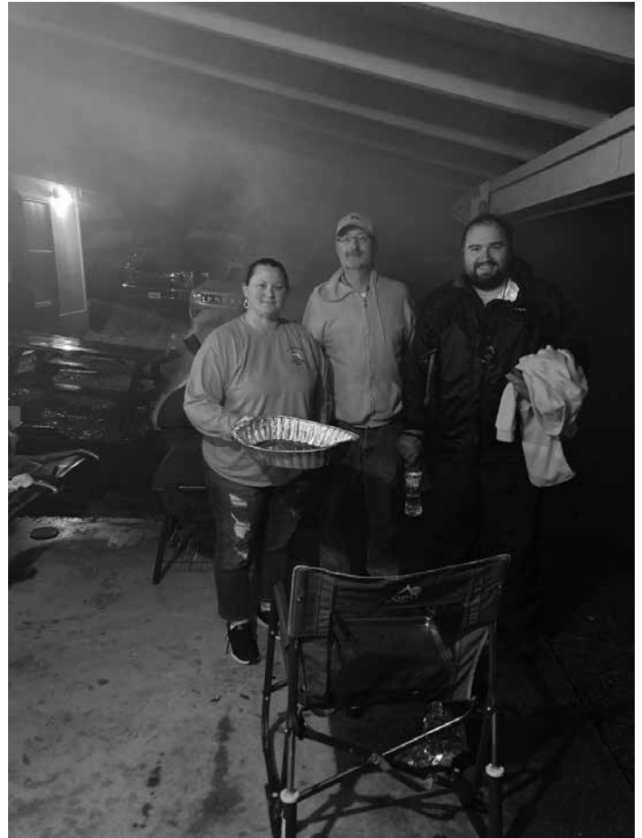
Cooking steaks Saturday night.