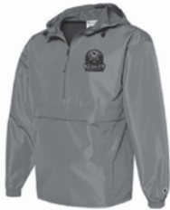
Graphite Champion Rain Coat $39.50 - $43.50 Low stock