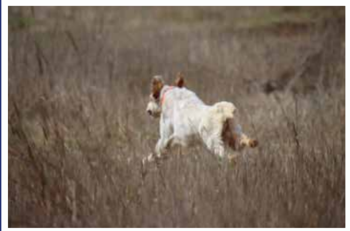
Jazz "So I told you so!"