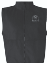
Black Fleece Vest $30.00 - $36.00