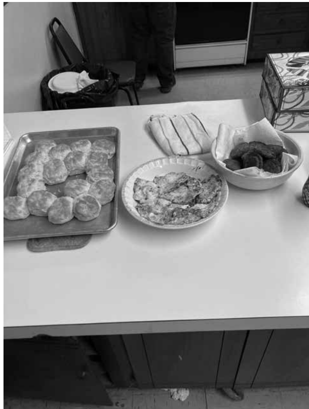
Saturday morning breakfast Dollie Cloud style.