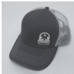
NSTRA Safety Yellow LFP Hat $18.00