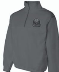
Charcoal 1/4 Zip Fleece Pullover $36.50 - $42.50