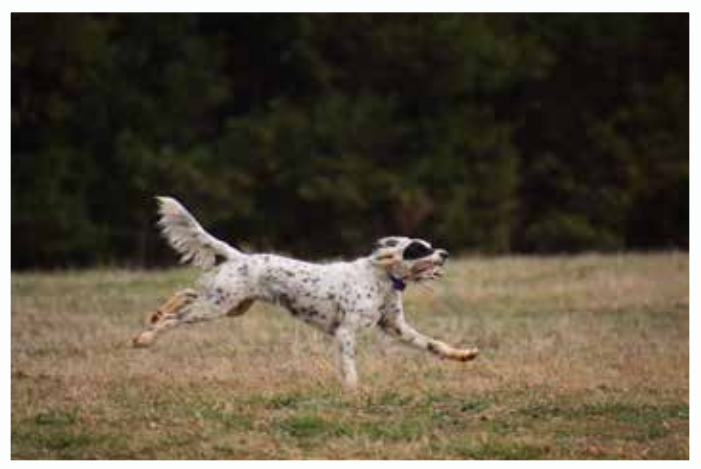
Ziva the retrieve