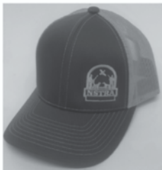
NSTRA left front panel logoed hat $18.00