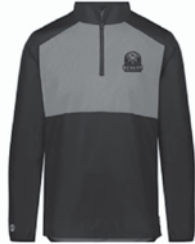
Series X Quarter Zip Pullover $54.50 - $57.50