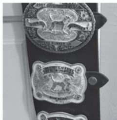
Trophy Buckle Hanger $50.00 - $60.00