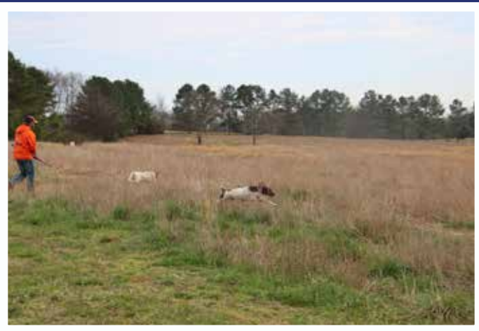
The last brace in the final 6 is away, Gauge and Ally