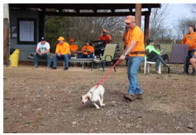
I am ready to go, can't you go any faster