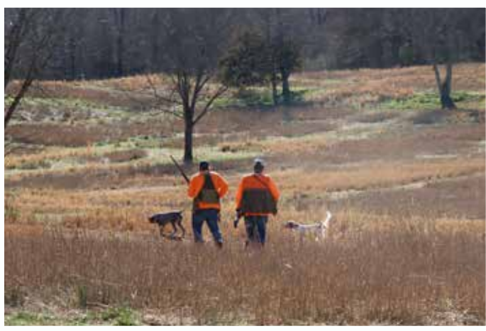
A point and a back