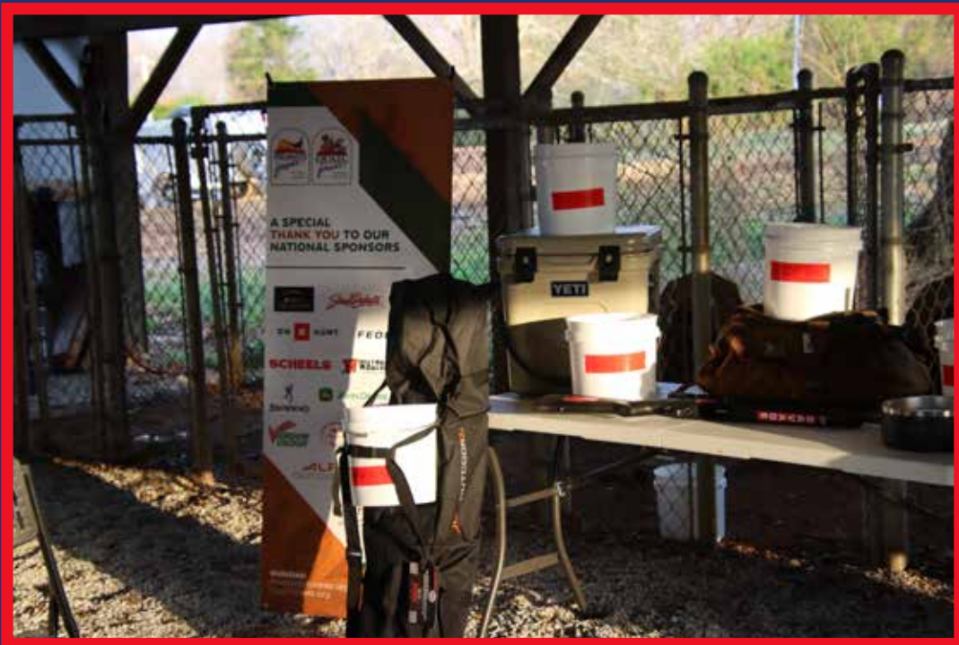
It also included a pulled pork meal, onion rings by Bill Sumpter (NSTRA president), and raffle tickets drawing by Quail Forever's representative, Kenny Barker, with a lot of really good stuff.