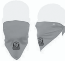
Safety Orange Face Guard $10.00 - $65.00