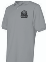
Safety Orange Polo $25.00 - $30.00