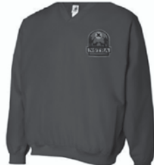
Black Wind Shirt $39.50 - $43.50