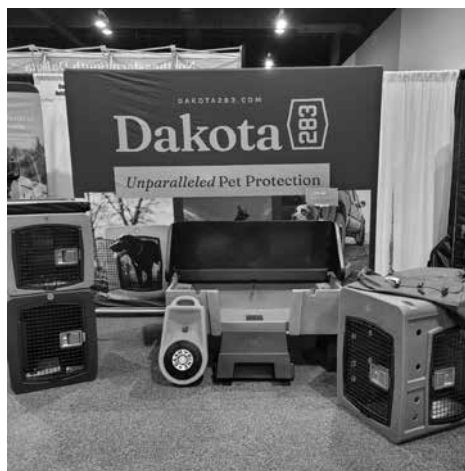
Dakota 283 Booth at Pheasant Fest