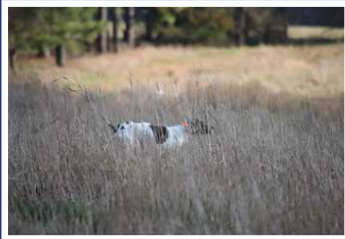
A nice point in the tall grass