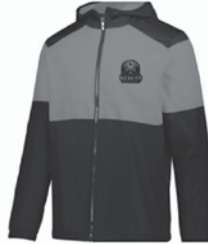
Series X Jacket $57.50 - $60.50 Low stock