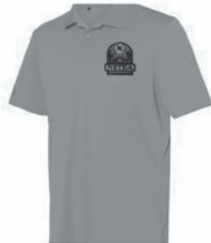
Orange Adidas Dri-fit Polo $44.00 - $48.00