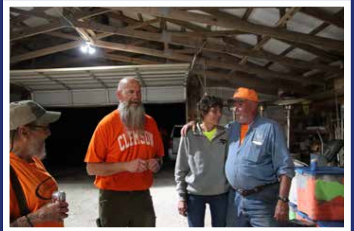
Friendly talk after the trial